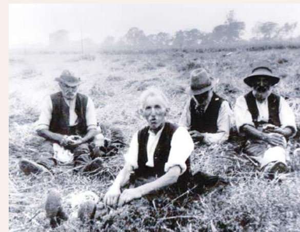
Local farm workers