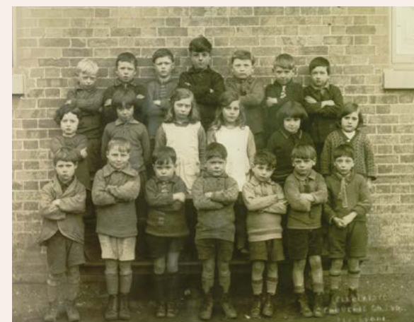
Coddenham School pupils

The Coddenham Village History Club has eight interesting talks arranged between February and November 2025 plus a coach outing. Annual membership is just £10 and is open to all.